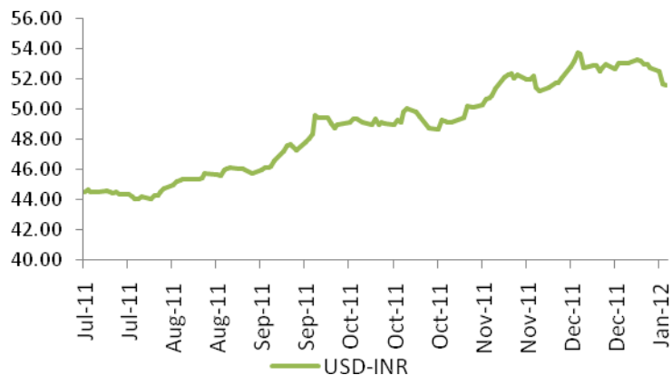
USD/INR – 14% Depreciation since July 2011